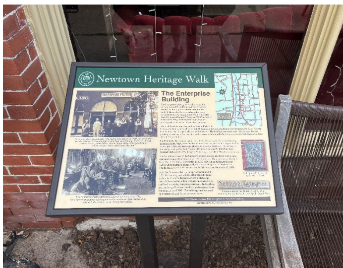
The Enterprise Building

The Newtown Heritage Walk is a self-guided walking tour consisting of thirty-six 18" x 24" wayside markers at historically significant sites in Newtown Borough and Newtown Township. Each stop has been selected because of its historical value to the community.