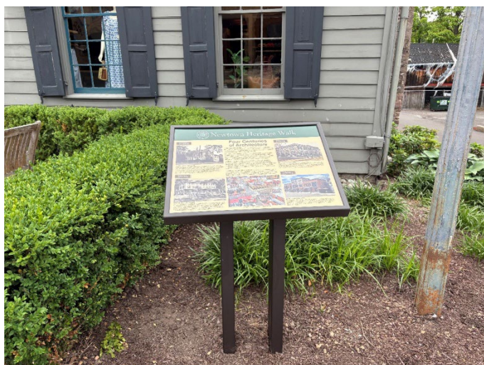
Four Centuries of Architecture

The second sign is located in front of the Enterprise Building at 126 South State Street. This sign highlights the history of the building which was built in 1874.