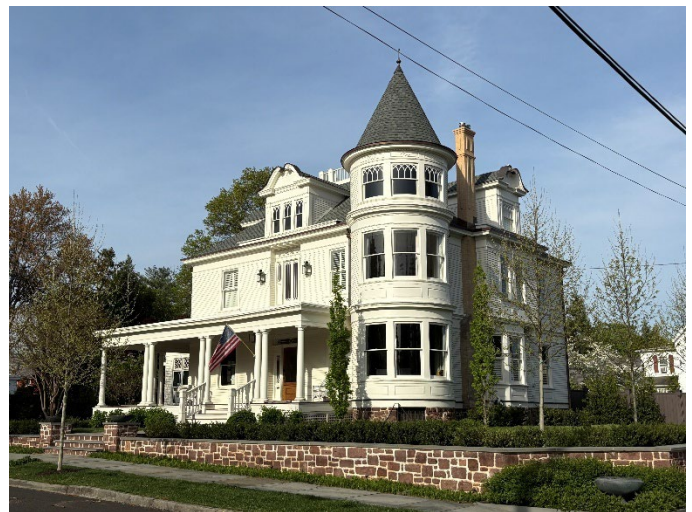
The Golden Rod House