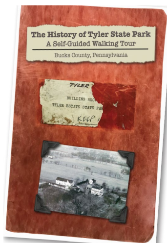
Tyler Park History Book cover.

Please note that the Tyler Park historical book will be available for purchase at this event ($15). This limited-edition, 100-page book contains rare photographs and detailed descriptions of the many historic properties and farmhouses, including the construction of the Tyler mansion, and how they were acquired by the Tyler family in the early 1900s.