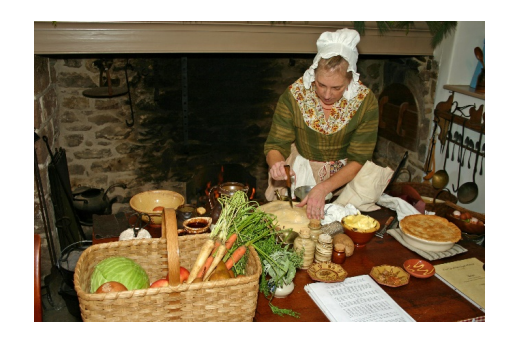
The table was set and waiting for empty stomachs.