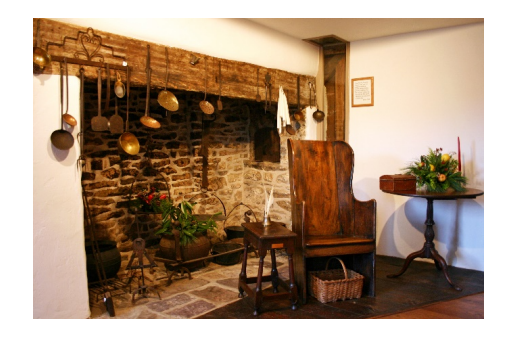
...while dinner was being prepared.