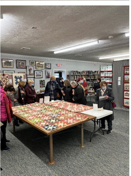
And from our "A Christmas Carol" December 3<sup>rd</sup> event...