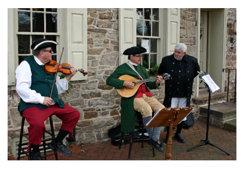
...and patiently waited to enter the private homes and public buildings.