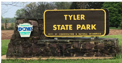
Tyler State Park Entrance Sign, 2021.

When Covid hit last year, the park served as a sanctuary for many people, but very few are aware of the park's deep and rich history.