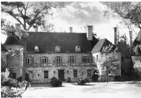
The Tyler Mansion, circa 1934.