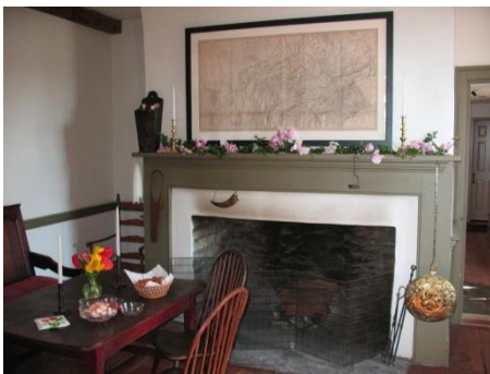
Tavern Room decorated