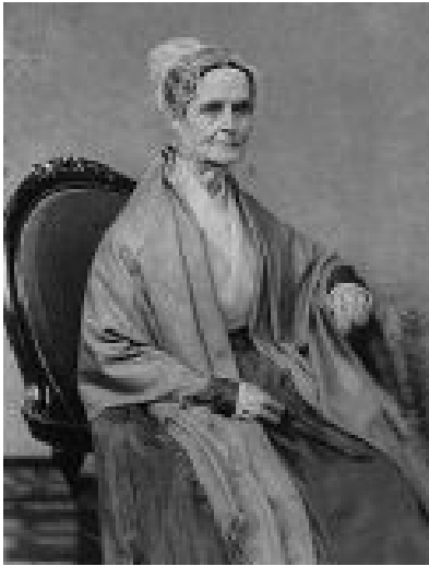
Lucretia Mott (1793-1880)