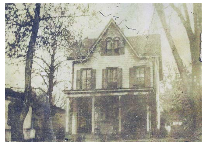
19 North State Street.