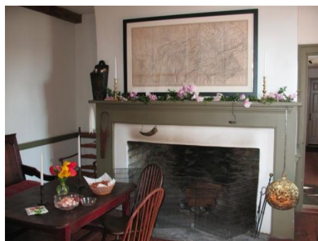
Tavern Room decorated