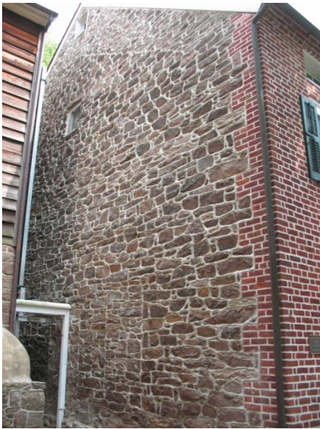
Thornton Hicks House north wall