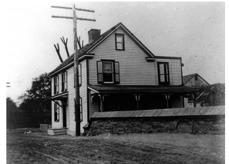
Centre Avenue Bridge, C. 1900.

are in place to assure that the proper historic treatments for restoration are carried out on buildings and structures recognized as important to our heritage, not only in this county, but also the nation. The original builders of the bridge gave us an inspiring structure that has lasted over 200 years. The current and future citizens of Bucks County deserve the best and most respectful treatment of this historic resource so that it can inspire for another 200 years.”