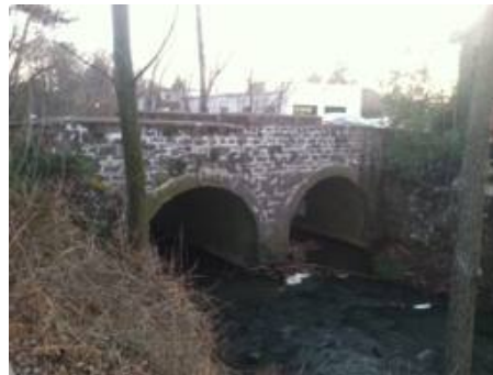
Centre Avenue Bridge, c. 2011.

As a result of these efforts, PennDOT postponed the project indefinitely. In the appeal process, it was discovered that the Centre Avenue Bridge was rated in PennDOT's engineering report as an 8 on a scale of 1-10 (10 being perfect).