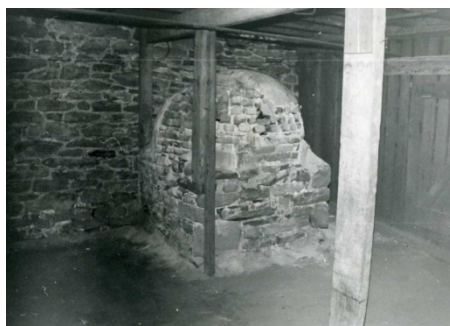
Bake oven before collapse, c.1980.

Again, the Newtown Historic Association is asking for contributions to help rebuild what was the oldest intact bake oven in the State of Pennsylvania.