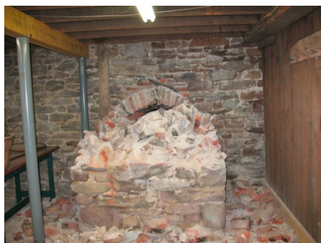
Bake oven after collapse, 2012