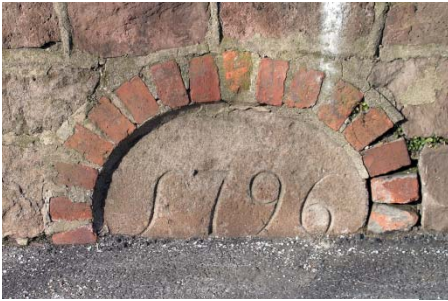
Centre Avenue Bridge Date Stone, c. 2005.

A few months ago, it was learned that PennDOT was going to undertake major renovations that would destroy the historic integrity of the Centre Avenue Bridge, which would probably result in the bridge being removed from the National Register of Historic Places on which it was placed in 1988 by PennDOT