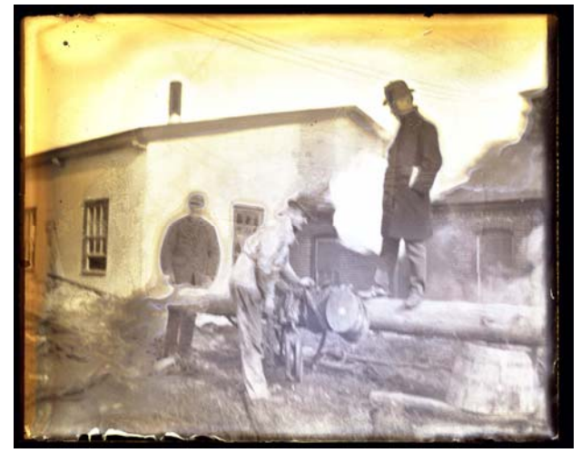
Workers readying the pole, pulley and cable system used to raise the 60 foot smoke stack into position.

they already have a large number of applicants for lighting, just as soon as the wiring can be done."