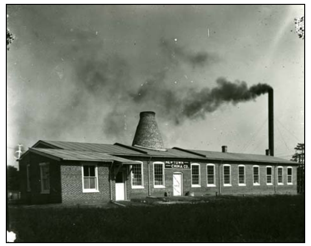
A view of the Newtown China Company located at 451 South State Street. Note the 60-foot smoke stack to the Newtown Electric Light and Power Company in the background, further evidence of its position in Newtown.

As you turn on your lights or other electric appliances, take a moment to remember just how exciting life must have been a little over one century ago when electricity made its first spark in Newtown from this location on South Lincoln Avenue.