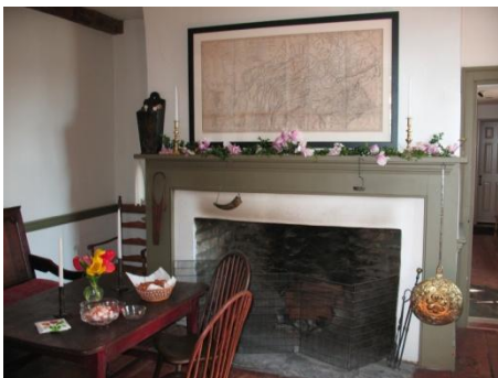
Tavern Room decorated